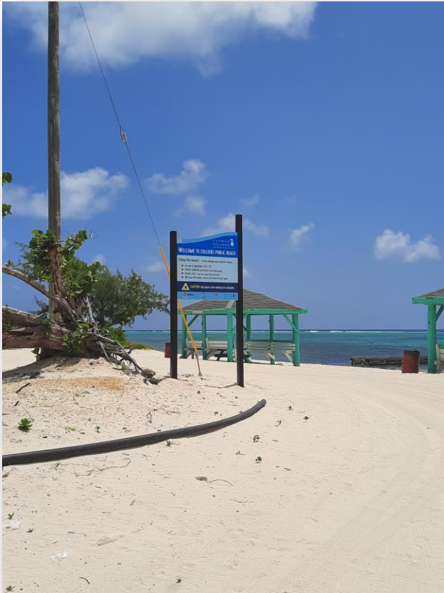
Colliers Public Beach